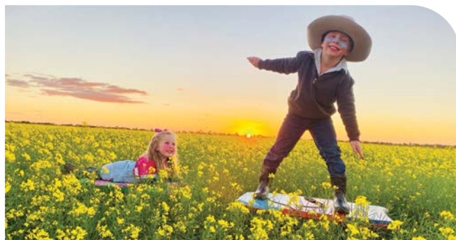
Brain family at Coleambally NSW