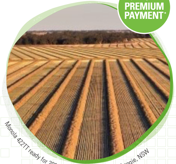
Monola 422T ready for 2023 harvest at Agriland near Trangie, NSW