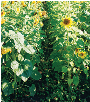
PRE residual herbicide No POST herbicide