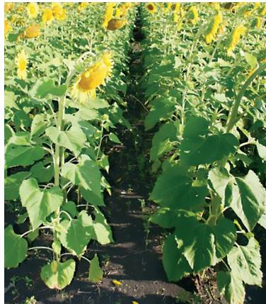
PRE residual herbicide followed by POST application of Beyond herbicide (4 oz/A) + MSO (0.25% v/v) + AMS (17 lbs/100 gal)

BASF Clearfield Plus Sunflower Field Trial (2010), NDSU, Fargo, ND.