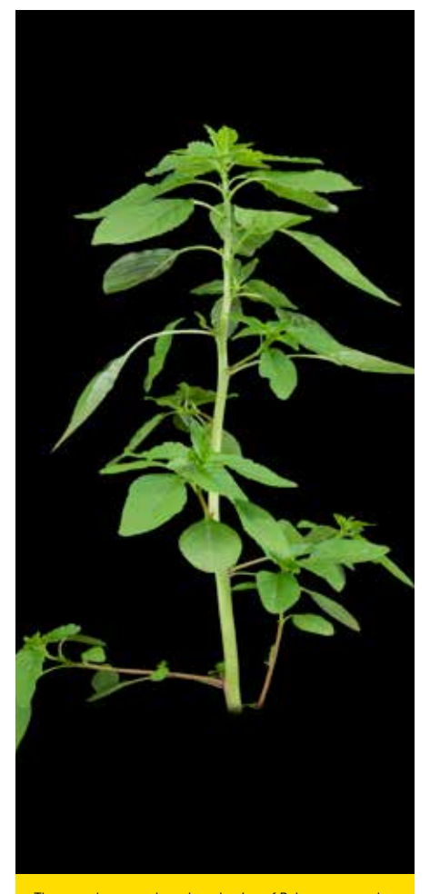
The growth rate and seed production of Palmer amaranth, combined with its propensity to develop resistance to herbicides, raises the threat level of this weed to the top.

BASF's Beyond herbicide (active ingredient imazamox) is a member of the imidazolinone chemical family. Members of this herbicide family control susceptible weeds by inhibiting the acetohydroxyacid synthase enzyme and are commonly known as AHAS or ALS inhibitors. It may be used with a Clearfield sunflower hybrid to control broadleaf weeds and grasses. At a use rate of 4 fluid oz/acre, it may be applied with an additional grass herbicide if needed. O