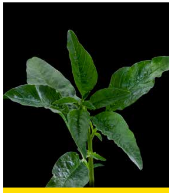
A waterhemp plant in lowa was documented to produce almost five million seeds per plant.